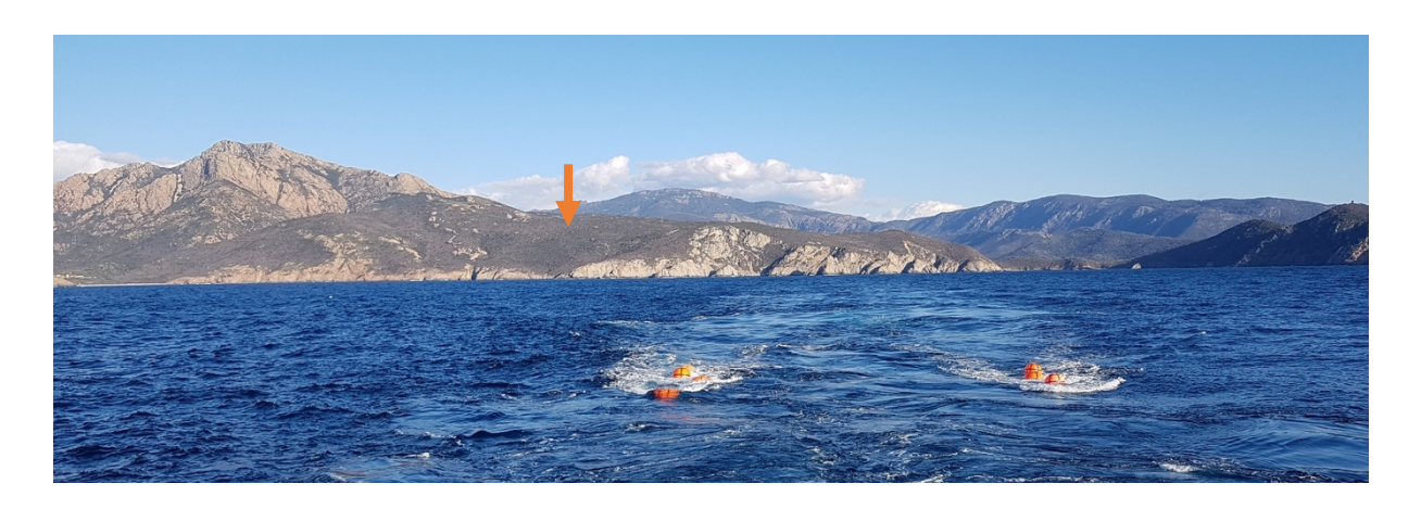
The position of a land seismometer on Corsica is marked by the orange arrow. In the water the orange bulbs mark the position of our airguns.