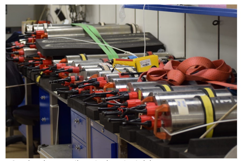
Our data loggers pile up in the seismic lab.

We will (hopefully) keep that 45-minute sequence for the coming 36 hours, so that our working deck and labs will again be full of gear, waiting for shipment back home from Heraklion.