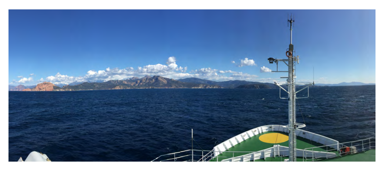
Relief of the island of Corsica, seen from the bridge of RV Merian S Merian.

While we deployed stations on the refraction line our Italian colleagues from the Italian National Research Council CNR / Istituto per la Dinimica dei Processi Ambientali die Milano installed 3 land stations on the western side of the island of Corsica, which will record our seismic signals to cover the shoreline transition. For optimal signal coverage we commenced shooting very close to the Corsican shore on Feb. 13, 2018 before heading back along the profile track.