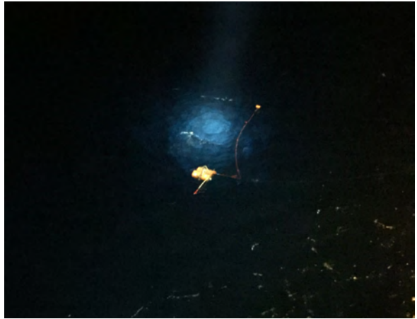
Ice flood light of RV Maria S Merian (left) and OBS in the light beam about to be recovered (right).

Despite our efforts, one station could not be recovered (A406A) and another one did not respond to the emitted release signal (A408A). After finishing our track to all 18 stations of the western AlpArray network we headed south during the night of Feb. 17, 2018 to recover the westernmost 22 stations along the refraction line. Military operations in the area forced us to leave the region until Monday, Feb. 18, 2018 at 07:00h.