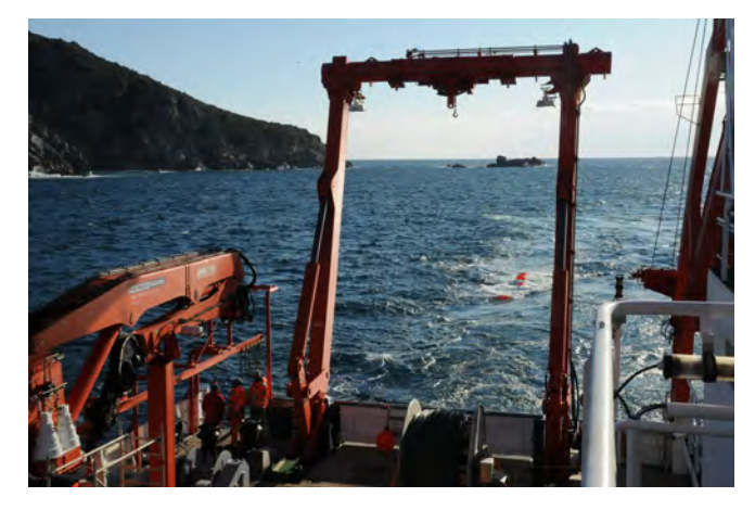
Begin of seismic profile off Corsica.